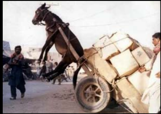
Loaded With News